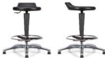
PAROS PG. 14