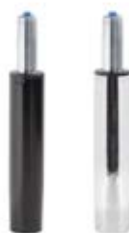
SF3240415 (black/nera) SF3240402 (chrome/cromata)

Telescopic column cover. Copricolonna telescopico.