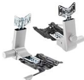
SN1601873 Permanent contact with knob for back height adjustment - grey. Contatto permanente con volantino per regolazione altezza schienale - grigio.