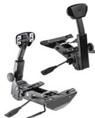
SM4552015 Asynchron mechanism with three levers and knob for back height adjustment. Meccanismo asynchron a tre leve con volantino per regolazione altezza schienale.