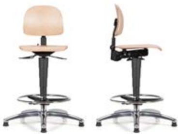
MEMPHIS WOOD PG. 8