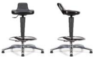
ASTREO PG. 13