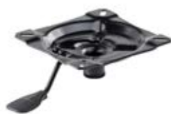
SM0102015 170x170 mm stool plate made of steel sheet with lever for gas spring activation. Piastra per sgabello in lamiera d'acciaio 170x170 mm con leva per comando gas.