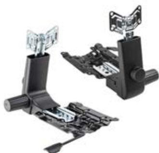
SN1601815 Permanent contact with knob for back height adjustment - black. Contatto permanente con volantino per regolazione altezza schienale - nero.