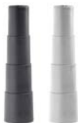
SE3022015 (black/nero) SE3022073 (grey/grigio)

H.375 gas column. Colonna a gas H.375 mm.