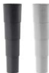
SE3002015 (black/nero) SE3002073 (grey/grigio)

H.223 gas column. Colonna a gas H.223 mm.