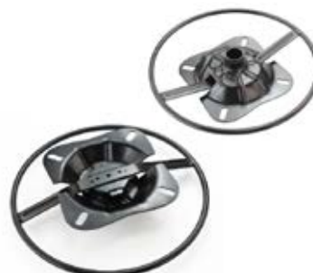
SM0104015 170x170 mm stool plate made of steel sheet with ring for gas spring activation. Piastra per sgabello in lamiera d'acciaio 170x170 mm con anello per comando gas.