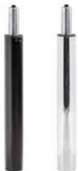
SF3350515 (black/nera) SF3350502 (chrome/cromata)

H.375 gas column. Colonna a gas H.375 mm.