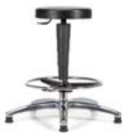
MILETO PG. 15