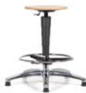
SPARTA PG. 16