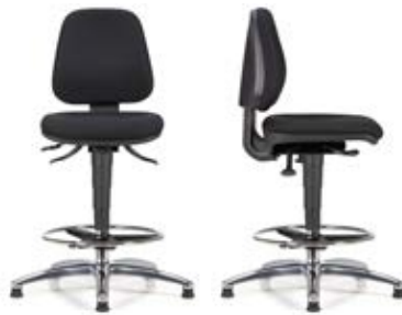
PETRA PG. 10