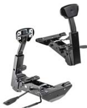
SM4502015 Asynchron mechanism with two levers and button for back height adjustment. Meccanismo asynchron a due leve con pulsante per regolazione altezza schienale.