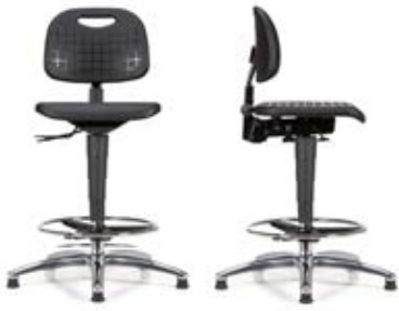
MEMPHIS PU PG. 4