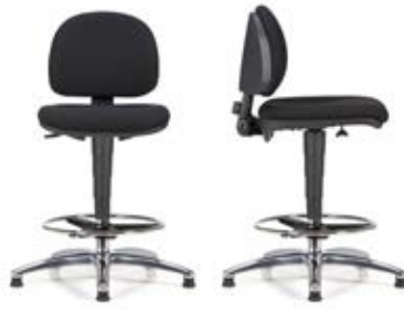
MEMPHIS UPHOLSTERED PG. 7