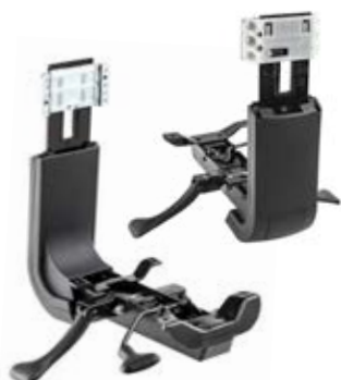
SM4602015 Asynchron mechanism with three levers and Up-Down backrest support blade. Meccanismo asynchron a tre leve e lama di supporto schienale con Up-Down.